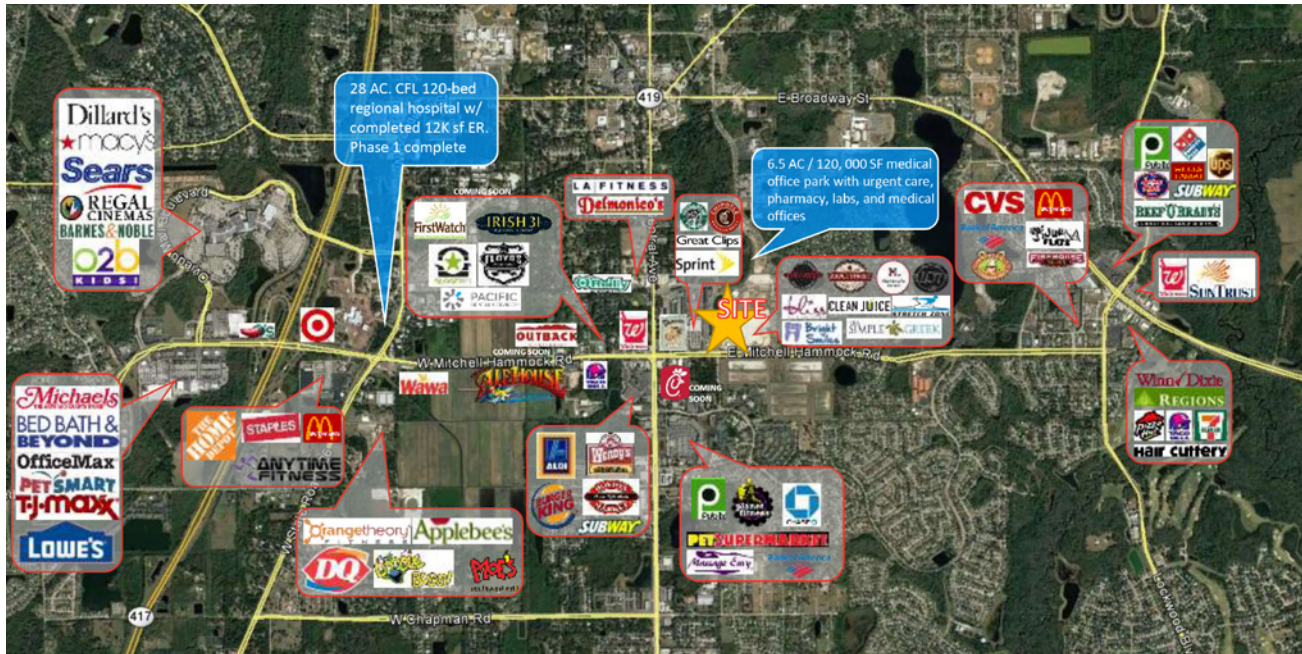
OVIEDO ON THE PARK- OFFICE SPACE SITE PLAN